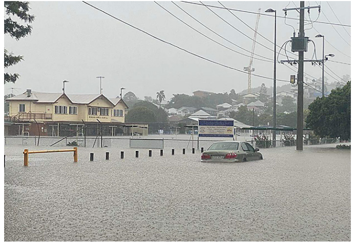
The rain was relentless