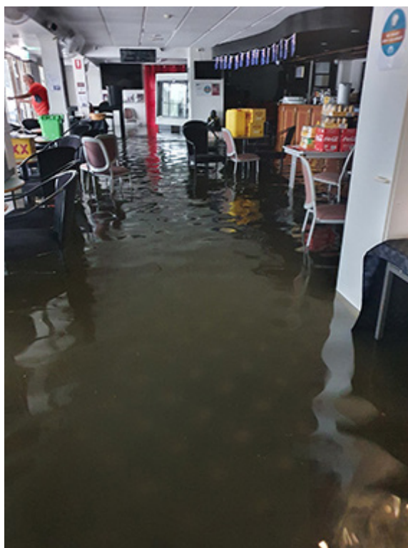
Inside the clubhouse before the water rose another 5 feet

The Clubhouse clean-up was a bigger challenge. Much help from our own bowlers, community members and members from other Bowls Clubs ensured that within a few days the ground floor had been gutted, hosed out and ready for a good drying out. A lot of hard work has been put in with the fruits of the labour enabling the Club to be up and running and doing well within 5 months. We still have a long way to go but hopefully by the end of the year we will have everything completed, with the new flooring and furniture being our last task.