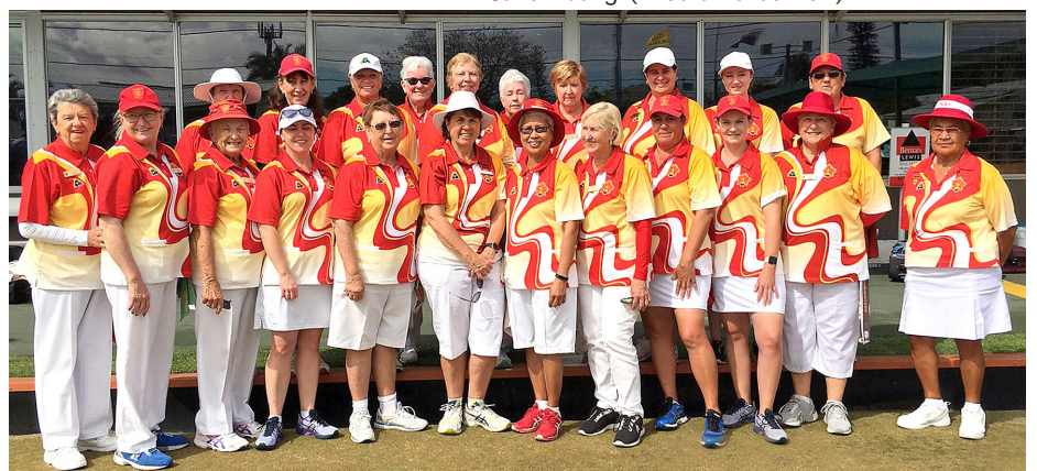
BDBA Ladies winning team in the 2022 Gold Coast Challenge Match held at Beenleigh Bowls Club on 23rd September