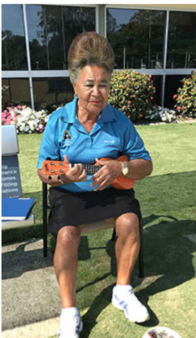
Serenading umpire at the final of District Ladies Pairs played at Ferny Grove on Monday 3rd October.