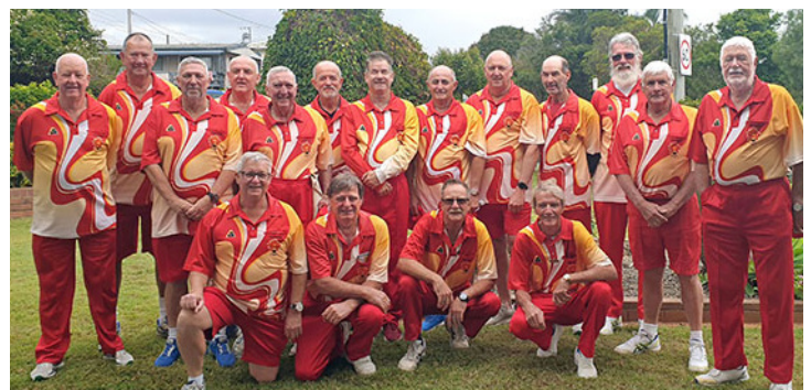
2022 BDBA Senior Inter-District Challenge side who played against Moreton Bay, Cunningham, Sunshine Coast at Pine Rivers Club. BDBA finished second.