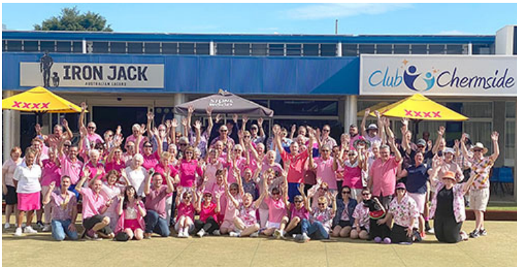
Pink was the fashion!

Chermside Bowls Club staged a very successful Pink Day on Sunday 9th October. Funds raised were donated to the Jane McGrath Foundation and St Vincent's foundation.