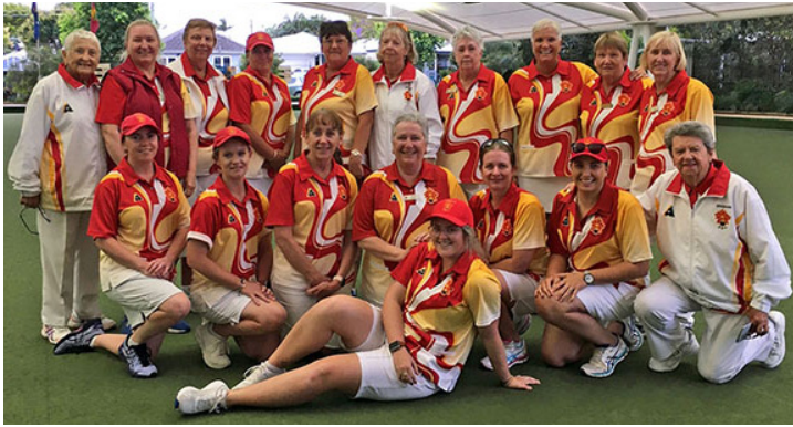
BDBA team who played in the 2022 Ladies Brisbane Shield at Manly Bowls Club on 16th October 2022