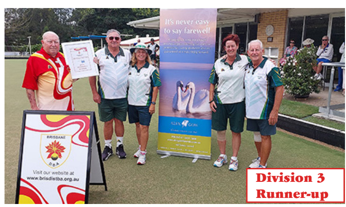
Ferny Grove Bowls Club