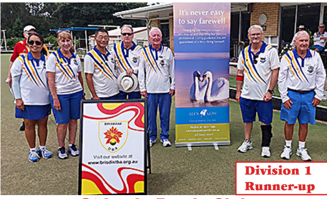
St Lucia Bowls Club