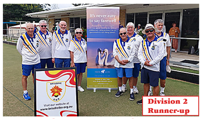
St Lucia Bowls Club